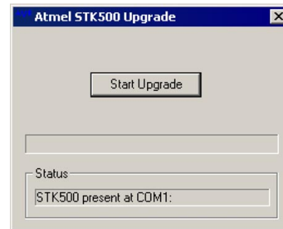
Figure 2. ATK500 Upgrade