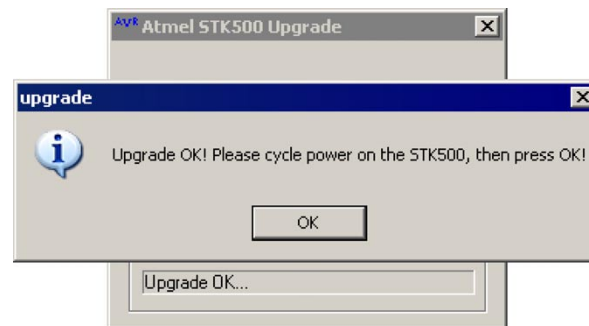
Figure 3. Confirm Upgrade